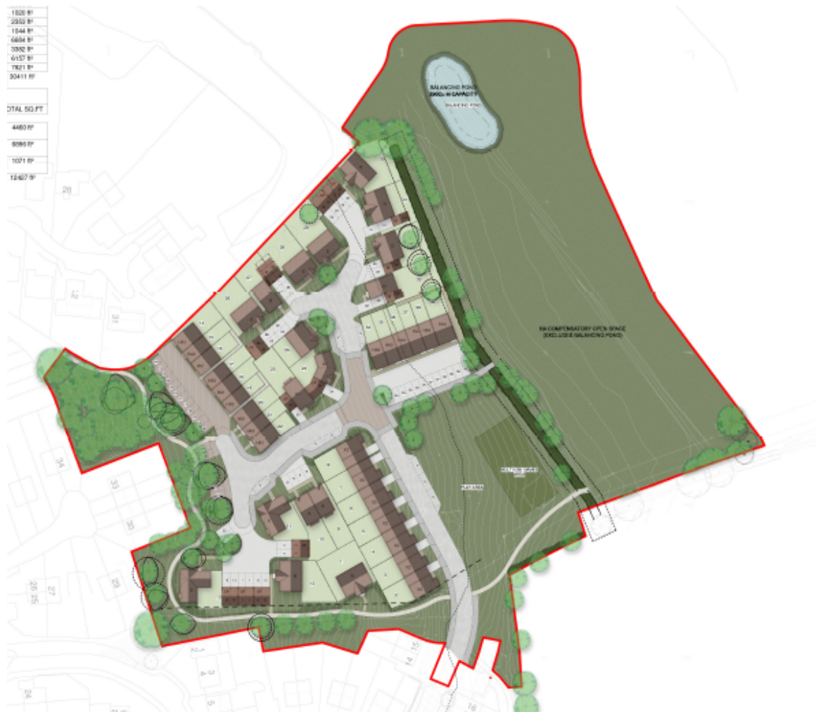
Illustrative Site Layout

This is an outline proposal for an estate of around 39 dwellings, with all matters reserved for subsequent approval. Within the estate a play area (0.2357 ha), to include play equipment and a multi use games area (MUGA), would be provided. In that part of the site which lies beyond the LOD, an area of “compensatory open space” for informal recreation/free play (1.1490 ha) would be provided and also a SUDS balancing pond (0.0510ha). Two 1.5m wide openings would link the equipped play area with the compensatory open space.